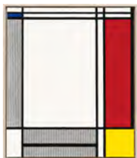
REGENSTEIN HALL Non-Objective I (1964) by Roy Lichtenstein

© Estate of Roy Lichtenstein. The Eli and Edythe L. Broad Collection, Los Angeles.