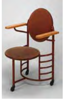
GALLERY 162 Chair (1936/39) designed by Frank Lloyd Wright