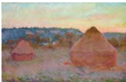
GALLERY 243 Stacks of Wheat (End of Day, Autumn) (1890/91) by Claude Monet

© Estate of Roy Lichtenstein. The Ruben Family.