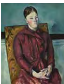
GALLERY 246 Madame Cézanne in a Yellow Chair (1888-90) by Paul Cézanne