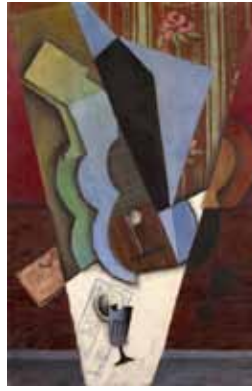
GALLERY 391 Abstraction (Guitar and Glass) (1913) by Juan Gris

© Estate of Roy Lichtenstein. The National Gallery of Art, Washington, Gift of Lila Acheson Wallace.