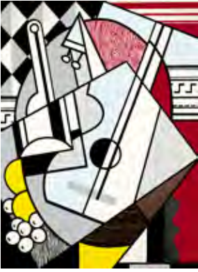
REGENSTEIN HALL Cubist Still Life (1974) by Roy Lichtenstein

© Estate of Roy Lichtenstein. The National Gallery of Art, Washington, Gift of Lila Acheson Wallace.