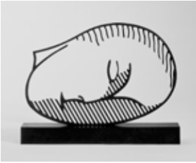
REGENSTEIN HALL Sleeping Muse (1983) by Roy Lichtenstein

© Estate of Roy Lichtenstein. Private Collection.