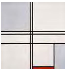
GALLERY 393 Composition (No. 1) Gray-Red (1935) by Piet Mondrian

© Estate of Roy Lichtenstein. The Eli and Edythe L. Broad Collection, Los Angeles.