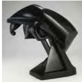
GALLERY 391 Horse (1914) by Raymond Duchamp-Villon

© Estate of Roy Lichtenstein. Courtesy of the Gagosian Gallery.