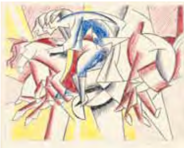
REGENSTEIN HALL Drawing for the Red Horseman (1974) by Roy Lichtenstein

© Estate of Roy Lichtenstein. Courtesy of the Gagosian Gallery.