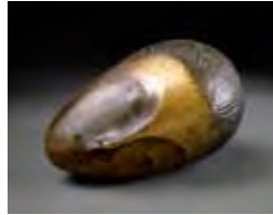
GALLERY 391 Sleeping Muse (1910) by Constantin Brâncusi

© Estate of Roy Lichtenstein. Private Collection.