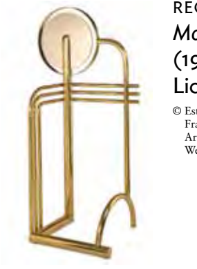
REGENSTEIN HALL Modern Sculpture (1967) by Roy Lichtenstein

© Estate of Roy Lichtenstein. San Francisco Museum of Modern Art, Bequest of Marcia Simon Weisman.