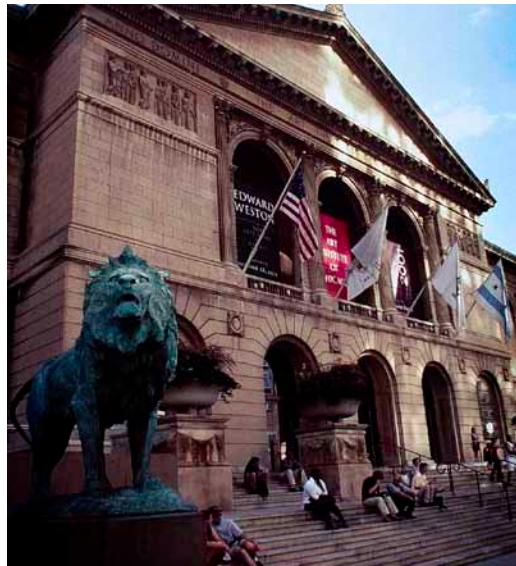
The Art Institute of Chicago [ TOP ] View of Modern Wing from Millennium Park, PHOTO CREDIT: Charles G. Young Interactive Design Architects [ BOTTOM ] South View of Michigan Avenue Facade [ COVER ] Detail of Facade, PHOTO CREDIT: Charles G. Young, Interactive Design Architects

The Architecture & Design Society gratefully acknowledges the ongoing support of Park Hyatt Chicago.