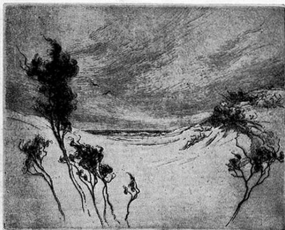
EARL H. REED—THE SONG OF THE EAST SHORE