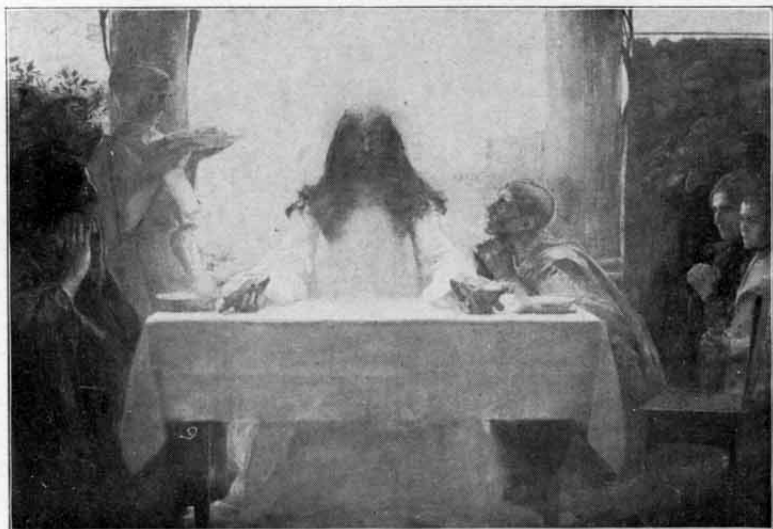
THE DISCIPLES AT EMMAUS. From the Carnegie Galleries of Pittsburgh, Pa.