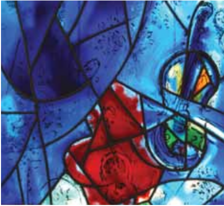
Be sure to visit the newly reinstalled America Windows by Marc Chagall in Gallery 144.