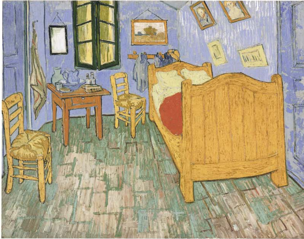
Vincent van Gogh (Dutch, 1853–1890), The Bedroom , 1889; Self-Portrait , 1886/87.

Vincent van Gogh found beauty in unexpected places and things, such as peasant life, a simple chair, or even an old pair of boots. This picture shows van Gogh's bedroom during the time he lived in Arles in southern France. In the work, he tried to express the sense of joy and peace he felt while living there. The room is simply furnished, except for van Gogh's own paintings hanging on the walls. How do the objects and colors in this scene make you feel?