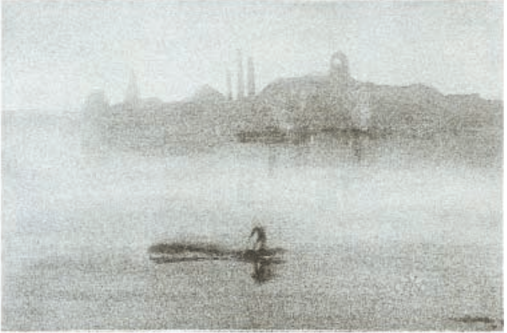
ABOVE: James McNeill Whistler (American, 1834–1903). Nocturne , 1878. Lithotint, on prepared half-tint ground, in black with scraping, on blue laid chine, laid down on ivory plate paper; 17.1 x 25.9 cm. Gift of the Crown Family in honor of James N. Wood (2004.529).