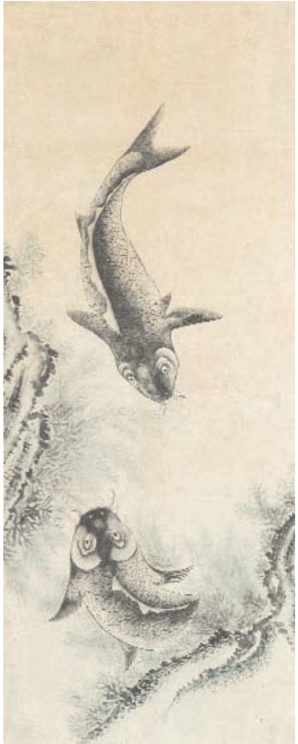
A Pair of Carp. Korea, Choson dynasty (1392–1910), 19th cen. Ink and color on paper; 106.3 x 41.9 cm. Restricted gift of the Asian Art Council (2005.54).