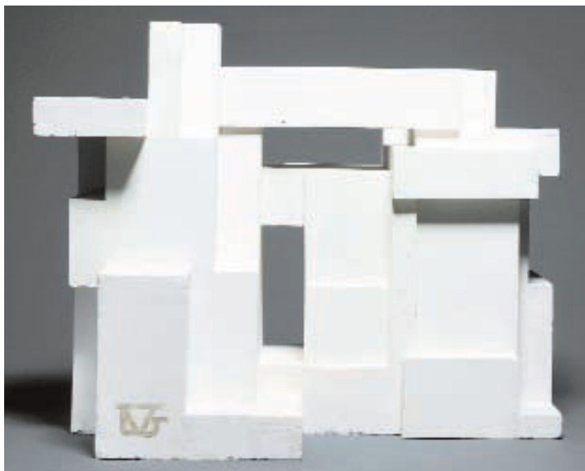
BELOW: Georges Vantongerloo (Belgian, 1886–1965). Interrelation of Volumes from the Ellipsoid , 1926. Plaster; 40 x 47 x 26 cm. Through prior gift of Lucille E. and Joseph L. Block; partial gift in memory of Lillian Florsheim (2004.245).