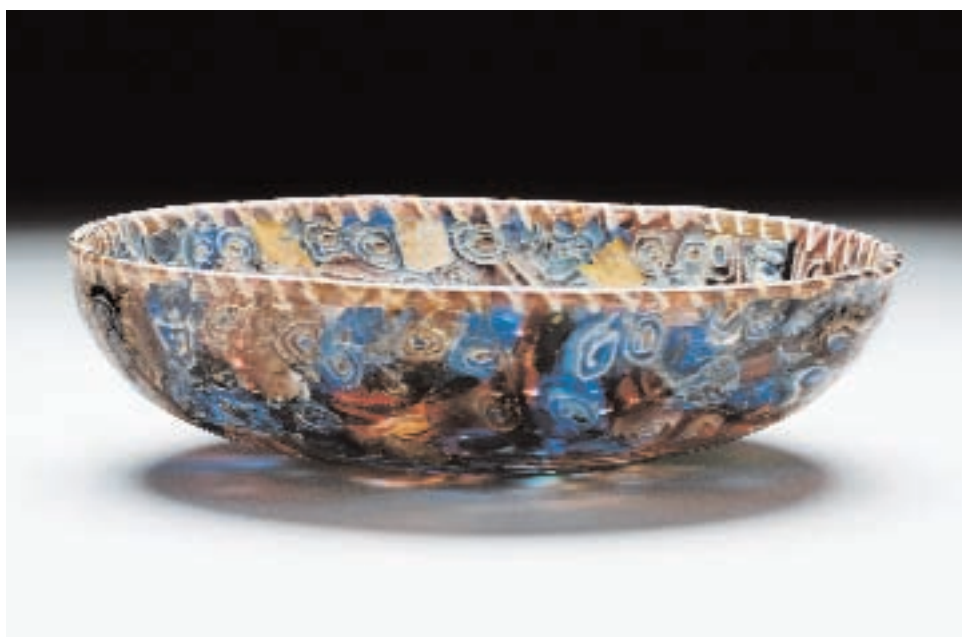
BELOW: Mosaic Glass Dish . Italy or eastern Mediterranean region, Hellenistic period, late 2nd or early 1st century B.C. Glass; h. 3.2, d. 13.6 cm. Katherine K. Adler Endowment (2004.722).